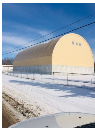
Coverall Sand Dome at the Public Works Stoco Garage