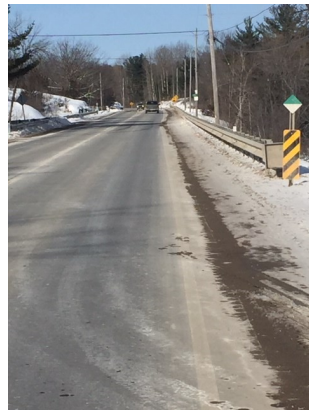
Marlbank Road Guardrails