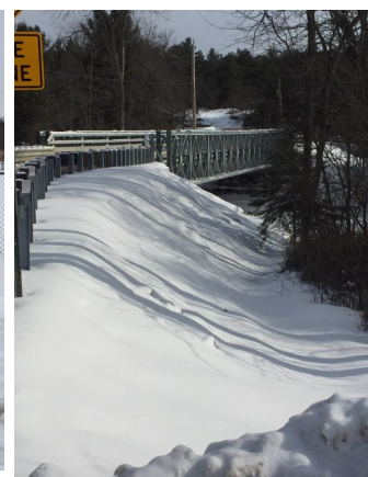
Hawkins Bay Bridge