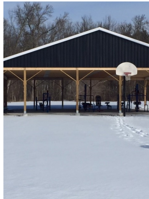
Senior Outdoor Fitness Equipment and Shelter