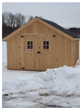
Marlbank Storage Building